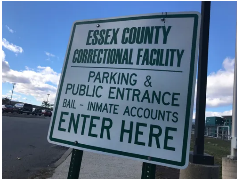
Essex County Correctional Facility sign

The announcement comes as advocates and immigration attorneys across the country renew calls for the release of immigrant detainees who don't pose a risk to the community and who have underlying health issues that may make them more vulnerable.